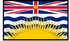
Pray for the Province of BC