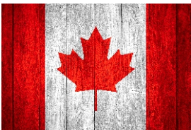
Pray for Canada