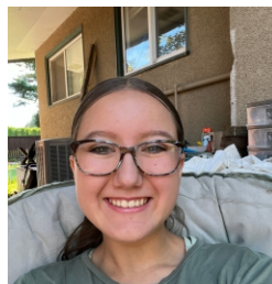
Lauryn Janzen Elementary LIT